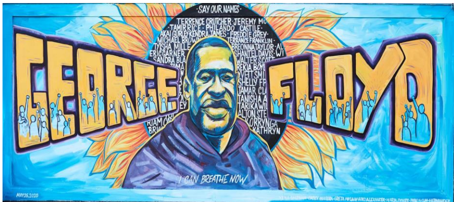
Wall mural in Minneapolis, USA

A Statement by the CATHOLIC BISHOPS' CONFERENCE of ENGLAND & WALES